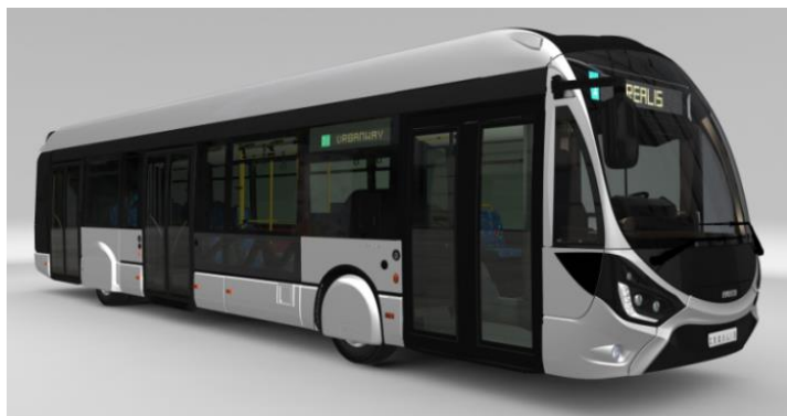
12 m CNG 3 doors