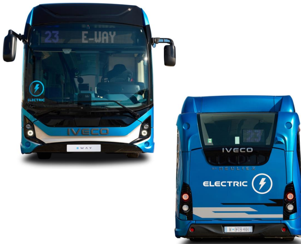
Layout 10.7 m

17 seats + “wheelchair” space (x) + driver